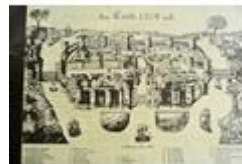
261. Map of Old Cork 1579 'A glimpse of the past' 29x39cm