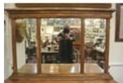
323. Regency style triple bevelled glass over-mantle with foliate decoration