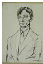
324. Michael Ayrton 'Study of a gentleman' pen & ink 30x22cm signed