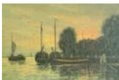
320. Dutch School 'Boats on a river at sunset' 20x26cm