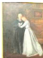
294. Victorian school 'The letter' oil on canvas 90x70cm