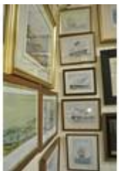
257. Norman Yates - Five 'Shipping scenes' watercolours 18 x 24cm signed