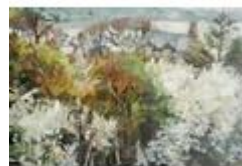
263. Irish School 'House by the wood' oil on board 30x21cm