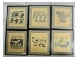
264. Set of six 'Oriental fable scenes' lithographs 28x25cm each