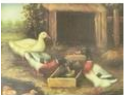
253. English school 'Ducks by a stream' 18x23cm