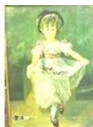
292. Victorian school 'Young girl dancing' 38 x 26cm