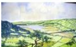
318. Catherine Scofield 'Antrim Landscape' watercolour 20x36cm initialled