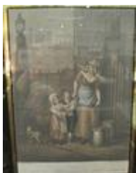
256. English School 'Pair of Cries of London' prints 29 x 20cm each