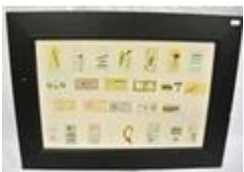
255. Players cigarette card collection framed 30 x 48cm