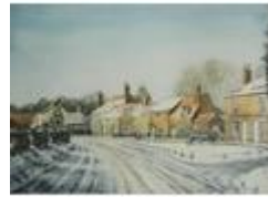
258. Alan Stanton 'Little Missendon' water-colour 29x38cm signed