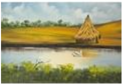
252. African School 'Swan in a river by a hut' oil on canvas 45x60cm