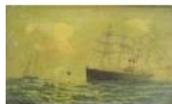
289. Victorian Maritime School 'Tall ship crossing' oil on board 12x20cm