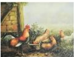
254. English School 'Farmyard chickens' 18x23cm