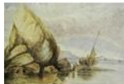
287. Irish School 'Grounded fishing boat by a beach' watercolour 23x32cm