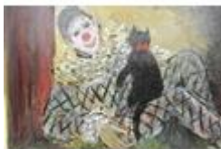
315. Gladys Maccabe RUA 'Clown with cat' oil on board 49x68cm signed