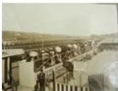
314. Sepia photograph of the Cork Race-course, Marina, Cork 30x40cm