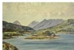
322. Patrick Hennessy 'Killarney Lake' oil on board signed