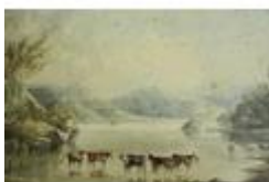
282. Irish School 'Turk lake, Killarney' watercolour 24x34cm