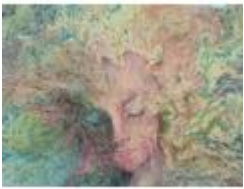
250. AM Smith 'Head' artists proof 68x70cm signed