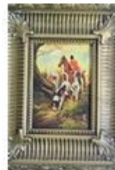
262. English School 'The Hunt' 10x15cm