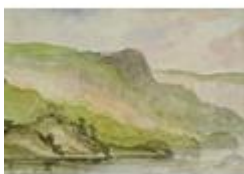
319. J Faulkner 'Riverside scene, Co Kerry' watercolour 17x25cm signed