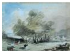
325. Sir John Crampton 'Woodland scene' watercolour 8x11cm