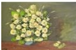
281. Terence Attridge Williams 'Still life study of flowers in a bowl' oil on board 23x30cm monogrammed