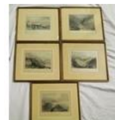
290. W H Bartlett, Set of five Irish scenes, prints 12x18cm each