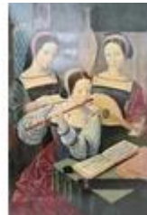
291. Victorian School 'The music lesson' oil on canvas 60x45cm