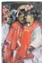
321. Sofie Renz 'Carnival' oil on board 30x20cm signed