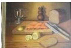
280. MA Bird 'Life study with food & a glass' oil on canvas 30x40cm signed