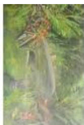
317. Irish School 'Woodland scene with ferns & river' oil on board 40x50cm signed indistinctly