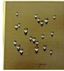
316. Irish school 'Drops' oil on canvas 39x34cm signed