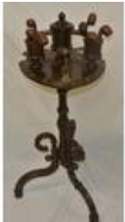
124. Unusual Victorian mahogany pipe smokers table with tobacco mixing vases, foliate decoration, on shaped tripod