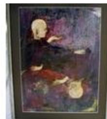
320. Irish school 'Dynamic Equilibrium' oil on board 55x40cm