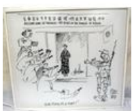
280. Bill Tidy cartoon 'its a trap' acrylic 160x115cm signed