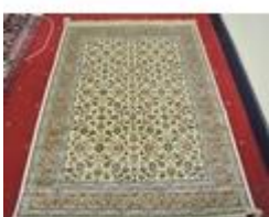
129. Ivory Ground Kashmir rug with all over floral design, 180 x 120cm