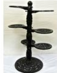
131. Edwardian style cast iron six branch plant stand with scroll decoration and circular base