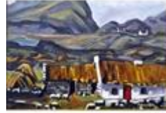
315. A Joyce O'Reilly 'Landscape' oil on canvas 40x50cm signed