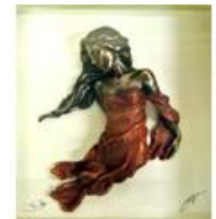
285. Genesis framed sculpture 'Autumn' 14x14cm signed