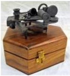
123. Edwardian style brass sextant in fitted case