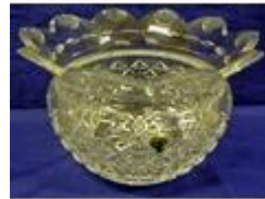
132. Waterford Crystal cut glass fruit or flower bowl with serrated wavy rim and diamond decoration