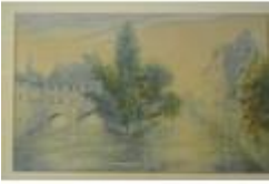
276. Jules Surchard 'Old Nuremberg' watercolour 21x34cm