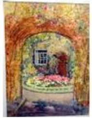
309. Irish School 'Floral Garden and Gazebo' watercolour 40 x 30cm initialled