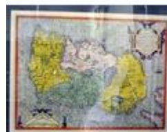
287. Ortelius Map, 'Hiberniae Brittannicae Insulae Nova Descriptio', 38x52cm