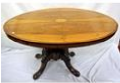
125. Edwardian inlaid walnut oval centre table with tip-up top, on quadruple columns, on splayed quadrapod