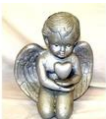
128. Ornate cast iron figure of a cherub