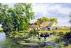
314. N Whitfield 'Farm scene' oil on board 48x72cm signed