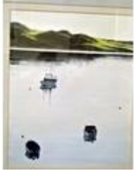
307. Jules Thomas 'Boats offshore, Schull, Co. Cork' 45 x 35cm signed