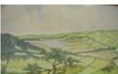
281. Catherine Schofield 'Antrim Landscape' watercolour 20x36cm initialled