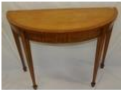
126. Edwardian inlaid and crossbanded satinwood demi lune hall or side table with ebony inlay, bowed frieze, on square tapering legs with spade feet