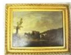
288. T Barker of Bath 'The watering place' oil on canvas 28x41cm detail verso