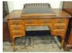
130. Edwardian oak kneehole desk with seven drawers, brass drop handles, lift-up lid, on square tapering legs with castors