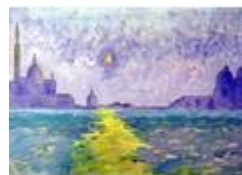
286. Liam 'Oriental scene' pastels 38x48 signed