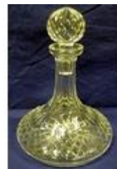
133. Waterford Crystal cut glass ships decanter with diamond decoration and stopper