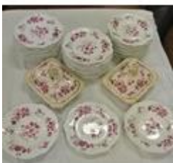
127. Thirty-five piece Victorian style dinner service with ornate foliate decoration