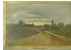
283. After Theodore Rousseau 'The path to the Village - Vendee' oil on canvas 18x29cm Initialled