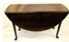
135. George II mahogany Pembroke table with D-shaped drop leaves, pull-out gateleg support, on cabriole legs with pad feet