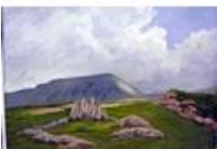
312. S Robinson 'Landscape' oil on board 40x50cm signed