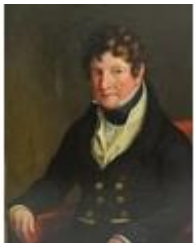
278. Victorian school 'Portrait of a gentleman' oil on canvas 90x70cm