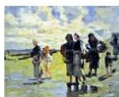
290. After Seargent 'Figures on a beach' oil on board 50x60cm