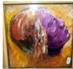
284. T Cougill 'Infinity' pastels 23 x 23cm signed