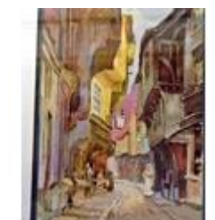
289. Continental school 'Street scene' watercolour 26x18cm