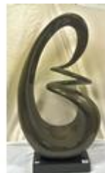
275. Art Deco resin sculpture of spiral form on raised base