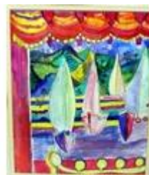
306. A P Arland 'View near a rock' and 'Floral Study' a pair pastels 50 x 40cm each signed