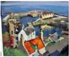
263. English School 'Port study' oil on board 50 x 60cm signed