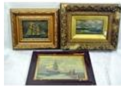
271. 3 maritime paintings, framed