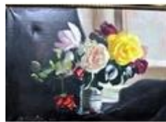
304. English school 'Still life study' oil on board 34 x 50 signed