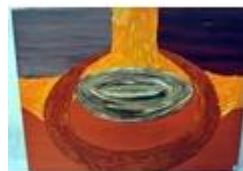
307. Anthony O'Brien 'Energy Flow' oil on board 60 x 80cm signed