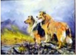
261. After Wright Barker 'Collies in a landscape' oil on board 44 x 58cm