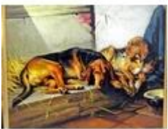
266. H Kelly 'Study of laying dogs' oil on canvas 50 x 60cm signed