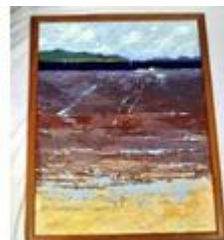
308. FAR Fursden 'Moorlands' oil on board 75 x 60 signed