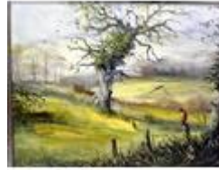
301. Audrey Knight 'Pheasants' oil on canvas 40 x 50cm signed