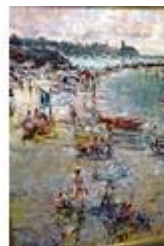
274. Arthur Maderson 'Lerici, Italy' palette knife 118 x 88cm signed