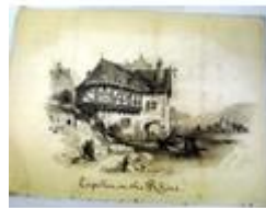
273. Norma Mulcahy 'Capellen on the Rhine' charcoal with wash, 37 x 50cm signed