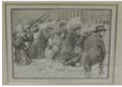
294. Shauna Griffiths 'The Easter Rising 1916' Pencil 34 x 45cm signed