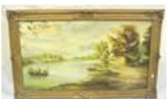
268. Brian Cross 'Fishermen by Fota' oil on canvas 50 x 90cm signed