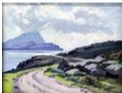
297. AP Jury 'Coastal scene' oil on board 25 x 32cm signed