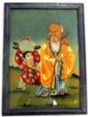
295. Oriental School 'Monk with child' oil on board 48 x 34cm