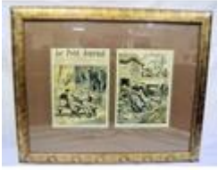
262. Le Petit Journal, two framed pages, 30 x 40cm each