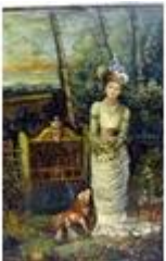
265. Rob Ghorne 'Portrait of a lady in a garden' oil on canvas 107 x 70cm signed