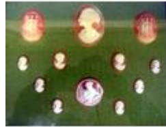
302. Framed collection of Victorian Cameos