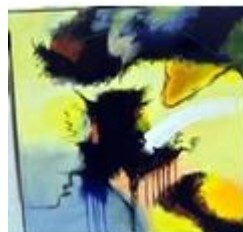
276. Graham 'Boom x Bust' oil on canvas 100 x 100cm inscribed