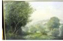
270. Ted Dyer 'Picnic in a meadow' oil on canvas 50 x 75cm signed