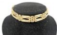
253. Ornate gold gate bracelet with clasp, 30g