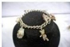
254. Ornate silverplated charm bracelet, 50g