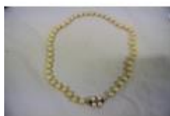
255. A string of pearls with clasp