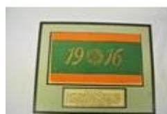
265. 1916 Veterans Armband devised by members of the Dublin brigade of the Old IRA for use on the occasions of the commemoration gatherings as distinctive badge for all who took part in the rising