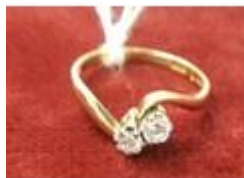
257. Engagement ring - 18 ct gold twist shank with two round brilliant diamonds