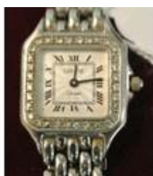
258. White gold diamond quartz watch 'Geneve'