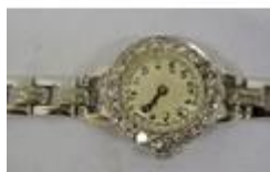
256. Ladies 9c white gold with diamond encrusted watch with round face and inscription verso