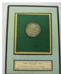
262. Repeal Association medal