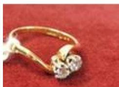
259. Platinum and diamond engagement ring