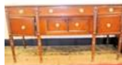
205. Nelson style mahogany sideboard with rope edge border, three drawers and four presses with reeded borders and brass drop handles, on turned legs