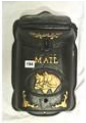
194. Cast iron postbox with horse decoration