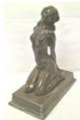
203. Art Deco style figure of "Kneeling lady" on oblong base