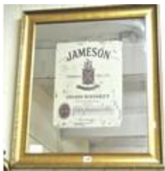
196. Gilt framed mirrored advertising sign 'Jameson Irish Whiskey'