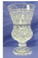
147. Ornate Waterford Crystal cut glass flower vase with serrated rim, strawberry diamonds and hobnail cut decoration, on round base