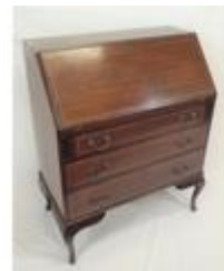
146. Edwardian inlaid mahogany bureau with fall-out front, fitted interior, three drawers under with drop handles, on cabriole legs