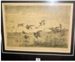
221. French School 'The bird shoot' limited edition, signed 45x30cm