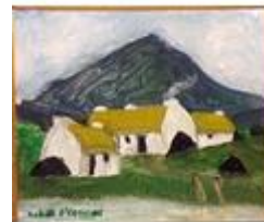
230. Cahill O'Connor 'West Ireland' oil on board 50x60cm signed