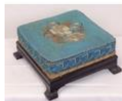
149. Edwardian square footstool with ornate foliate needlepoint