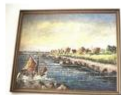
233. Continental School 'Riverside study with boats and cottages' oil on canvas, signed H88 x 73cm