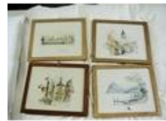
229. Set of four coloured prints 'Continental scenes' 22x29cm each