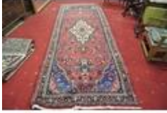
193. Washed red ground full pile Sarouk runner 319 x 116cm