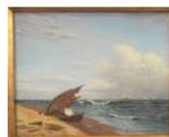
234. Dutch school 'Wreck on a beach' oil on board 19x24cm signed