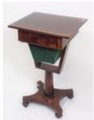
195. William IV mahogany work box, the drawer with sectioned shelf, and material drawer under, on U-shaped stand, on hexagonal shaped column with collar, on concave plinth with ball feet