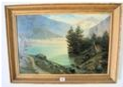
224. E. Tauber 'Continental lakeside scene with trees' oil on canvas 38x58cm signed