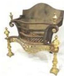
204. Victorian brass and cast iron serpentine fronted fire grate with shaped finials and pierced decoration