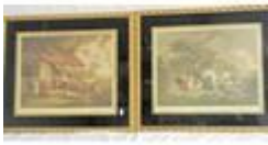
222. John Cother Webb 'The benevolent sportsman' and After George Morland 'Figures outside an inn' coloured pair of mezzotints 36x46cm each signed and stamped