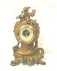
201. French style ormolu mantel clock with cherub and foliate decoration, circular enamel dial, and shaped base