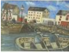
235. Orla Egan 'Times past at Ramelton' oil on board 16x20cm signed