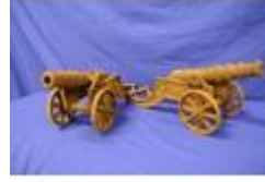
199. Pair of cast iron model cannons on wheeled carriages