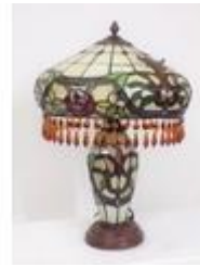
144. Art Deco style table lamp with ornate and multi-coloured shade, on round base