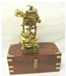
143. Edwardian brass theodolite with telescope and level on swivel base, in presentation case