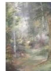
249. Lia Walsh 'Woodland Path' oil on board 62x75cm signed