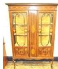
150. Edwardian inlaid mahogany display cabinet with glazed doors and sides, shelved interior, ornate ribbon herringbone and foliate inlay, shaped apron, on cabriole legs with pad feet