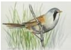
225. Irish school 'Study of a Bearded Tit' watercolour and pencil 12x17cm signed