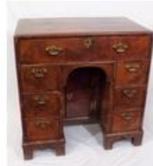
145. Early Georgian walnut and rosewood kneehole desk with frieze drawer, six side drawers, brass drop handles with pierced back plates, on bracket feet