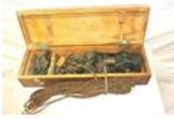
192. Yachtmaster ships log in fitted carrying case