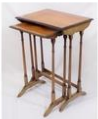
141. Nest of two Edwardian mahogany tables with turned tapering columns, cross stretchers and bracket feet