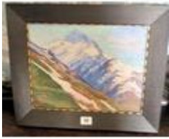
220. Continental School 'Alpine study' oil on board 24x30cm