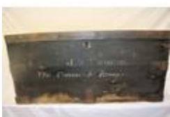
198. Vintage oak military chest with press, stamped "J Twohig The Connaught Rangers"