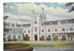
232. Peadar Drinan 'Quad, UCC' limited edition print 36x56cm