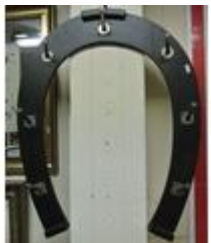
197. Edwardian style horse-shoe shaped coat hanger with metal hooks