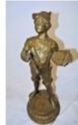
202. Spelter figure of a young artist on circular spreading base