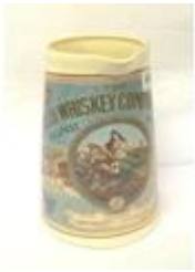
137. 'Irish Whiskey Company, Belfast, Ireland' advertising jug with shaped handle