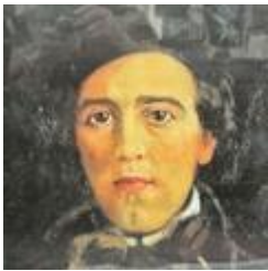
223. Grace Henry HRHA 'Portrait of Paul Henry' coloured print 38x40cm