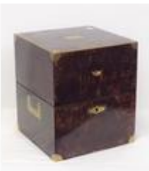
142. Victorian Coromandel liqueur tantalus with brass handles and banding, sectioned interior, with brass lock