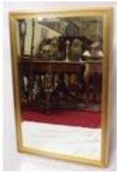
139. Long bevelled glass wall mirror with gilt frame