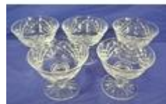
148. Set of five Waterford Crystal cut glass sundae or champagne glasses with diamond decoration and knop stems