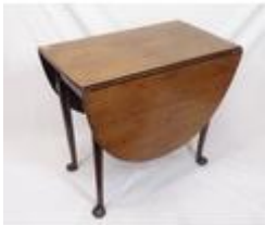
140. Victorian mahogany Pembroke table with D-shaped drop leaves, pull-out gateleg support, on cabriole legs with pad feet