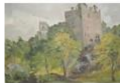
248. Irish School 'Blarney castle and woodland' oil on board 50x60cm initialled