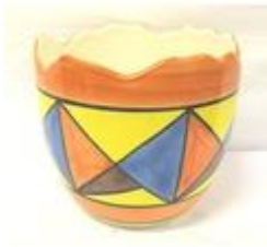
138. Art Deco style bowl with wavy rim and geometric pattern