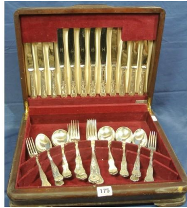
175. Canteen of Irish silver Kings Pattern handled cutlery in fitted canteen