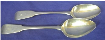
173. Pair of Irish George III silver dessert spoons with fiddle pattern crested handles, by Samuel Neville, Dublin 1820/21. 51g /17cm