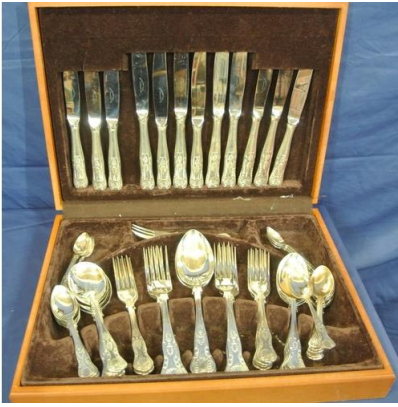
142. Canteen of Newbridge cutlery with Kings Pattern handles