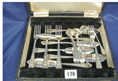
176. Lot of Irish & other silver cutlery, Newbridge Cutlery Co, etc