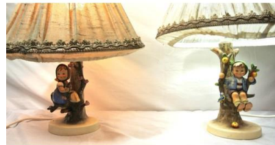
40. Pair of Hummell figured lamps by Goebel, Germany