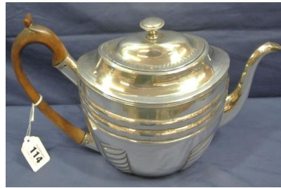
114. George III London Silver teapot of oval form with reeded and panelled decoration, finial, timber handle and shaped spout, by Peter, Ann & Wm Bateman, London 1804