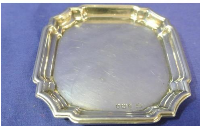
112. Small George V London silver tray with raised rim, shaped borders, by Goldsmiths and Silversmiths Co, London 1918