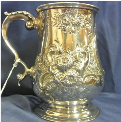
136. London Victorian silver baluster shaped mug with ornate foliate embossing, scroll cartouche, leaf capped scroll handle, on round stepped base, London 1860, 325g, 13cm h