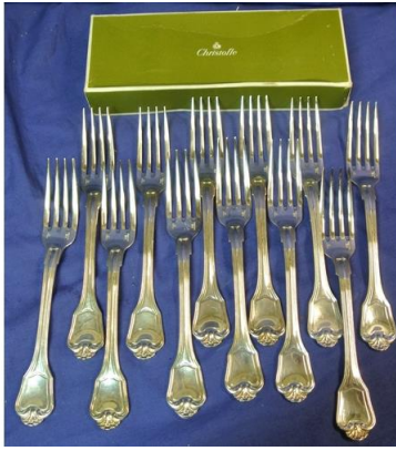
35. Set of 12 Christofle silver dinner forks with thread edge handles, in box