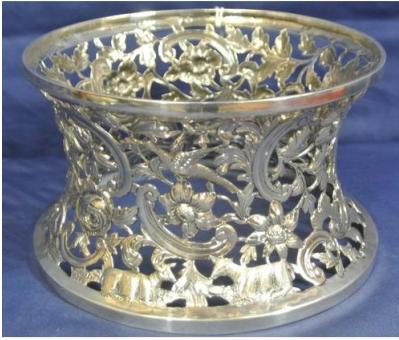
238. Irish Silver George IV dish or potato ring of round waisted form, decorated with birds, animals, foliage and swags, crested cartouche, by Samuel Neville, Dublin 1829, 305gr, diam 17.5cm