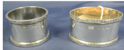
242. 2 Irish silver napkin rings with decorated rims, by William Egan & Sons, Cork, 1963, & 1966 with Sword of Light hallmark, 95g