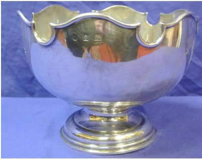
105. Birmingham George V silver rose bowl with scalloped rim, on round stepped base, 458g, 20cm diam