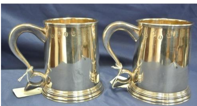
240. Pair of Irish Silver tankards of round tapering form with reeded rims, shaped handles, on stepped bases, by Royal Irish Silver Ltd, Dublin 1968, 1132g, H11cm