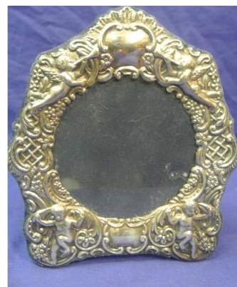
116. London silver photo frame with round centre, ornately decorated with cherubim, swags and scrolls