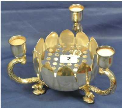
2. Silverplated round centrepiece flower vase with domed rim, candle sconces and shaped legs, by Viners of Sheffield