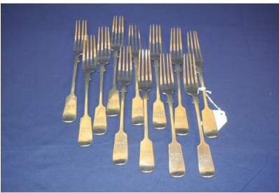
143. Set of 12 Victorian London silver dinner forks with crested fiddle pattern handles, 1896, 883g, L21cm