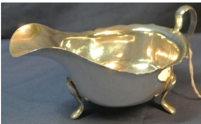
107. Sheffield silver boat shaped sauce or gravy boat with wavy rim, scroll handle, on 3 pad feet