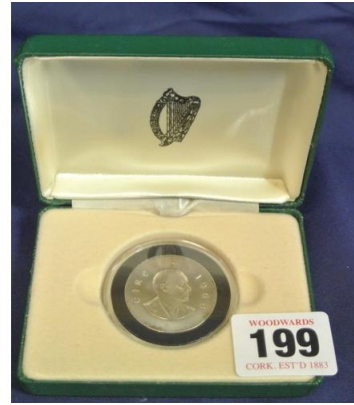
199. Irish Silver 'Padraig Pearse' commemorative coin 1916-1966, in case