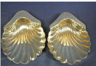
137. Pair of Birmingham silver shell shaped bon-bon dishes, initialled and on ball feet.