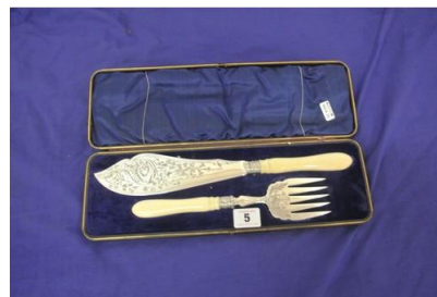
74. Pair of servers in presentation case with Sheffield silver bands, by Joseph Rogers & Sons, 1871 and with bone handles and Shamrock etching