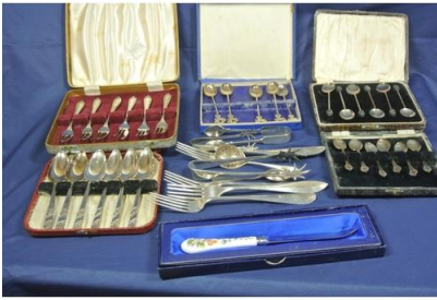
49. Assorted lot of Birmingham and Sheffield silver spoons in cases, and other cutlery