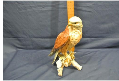
39. W. Goebel ornament of a Falcon, H 23cm, base 10cm