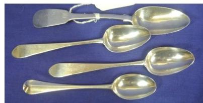
158. 4 Irish George III teaspoons: Pair stamped 'JS', one rubbed, one by Laurence Nowlan c.1820. 60g / 15-10cm