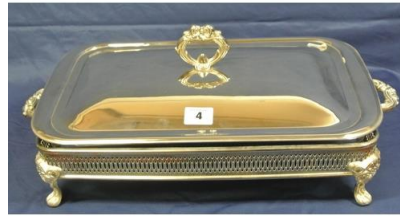
4. Large silverplated and glass tureen or dish with pierced sides and shaped handles