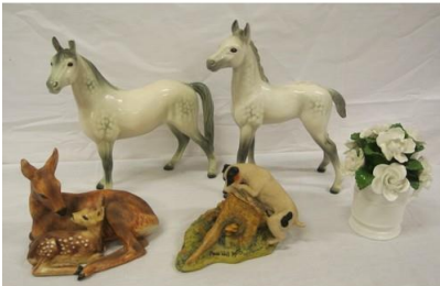
37. Lot of ornaments, some Goebel, Deer, fawn, Horses, Dog, etc,