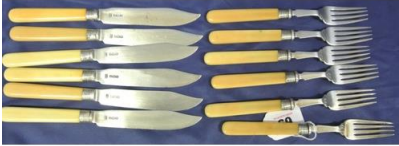
69. Set of 12 Sheffield silver bone handled dessert cutlery by Mappin & Webb