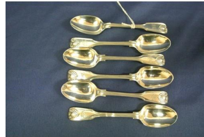
147. Set of 6 Victorian London silver teaspoons with thread edge Kings fiddle pattern handles, 1896