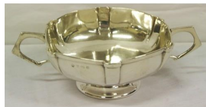
73. Birmingham silver porringer with shaped panelled sides and handles, on raised round foot. H 5cm X L 16cm X D 11cm W 110g