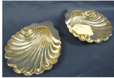
108. Pair of Sheffield silver shell shaped bon-bon dishes with scalloped rims, on 3 ball feet, 1899