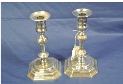
51. Pair of Sheffield silver candlesticks with detachable sconces, shaped columns, of stepped bases