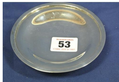
53. London silver round tazza with spreading base D11cm W 94g