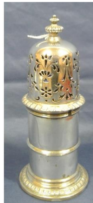
109. Sheffield silver sugar caster with shaped finial, pierced top, on round stepped base, H16cm, 245g