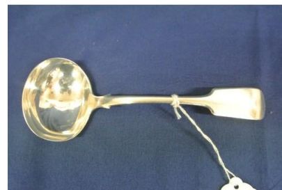
148. Sheffield silver sauce ladle with oval bowl and fiddle pattern handle, 1901