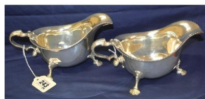
243. Pair of Irish Silver boat shaped sauceboats with gadroon rims, scroll handles, on cast feet, by Royal Irish Silver Co., Dublin 1970, 857g, L20cm