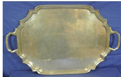
140. Large Birmingham Victorian silver tray with raised shaped rim and handles, 2450g, 62x39cm