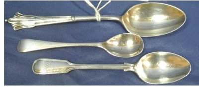
72. Sheffield silver teaspoon with shaped reeded handle, and 2 Sheffield tea/mustard spoons, 74g