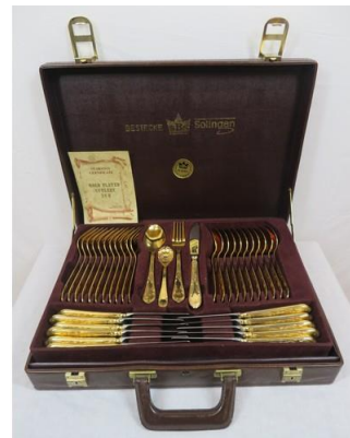
141. 70-piece Bestecke Solingen canteen of cutlery in fitted case