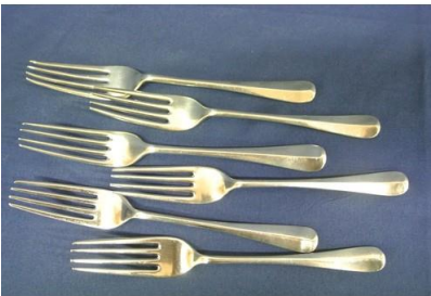
144. Set of 6 Sheffield silver rat-tail dessert forks, 1945