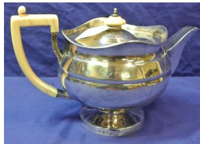
110. George III London silver round teapot with wavy raised rim, hinged lid, bone handle and finial, raised on round base, London 1806, 680g, H16cm