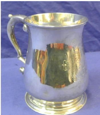
113. George III London silver mug of baluster form, crested, with initialled scroll handle and round spreading base, London 1782, 292g, h 12cm