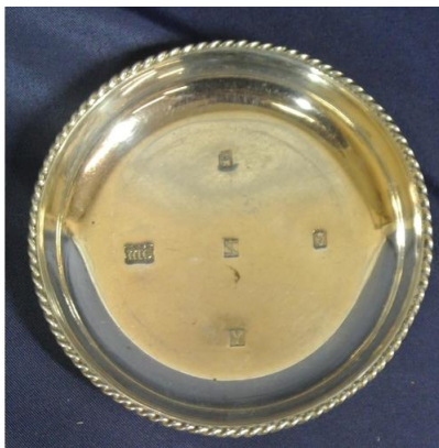
239. Irish Provincial Silver pin tray with gadroon rim, with 'Sword of Light' commemorative mark for 1966, by William Egan & Sons, Cork, 54g, diam 9cm.