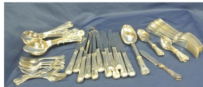
5. Lot of Newbridge silver plated Kings pattern cutlery