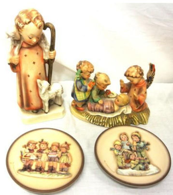
41. 2 Hummell figures of children and a pair of Hummell plates