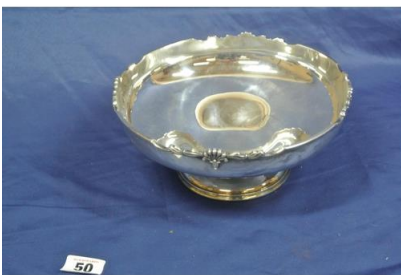
50. Sheffield silver round fruit or flower bowl with shell decorated and reeded rim, on spreading base H37. D 38. W 1245g