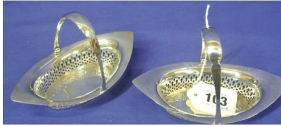
153. Pair of Birmingham silver oval sweet baskets with pierced decoration and swing handles.100g.