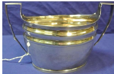
115. George III London silver oval sugar bowl with reeded rim and handles and reeded base, London 1799, 185g, L19cm