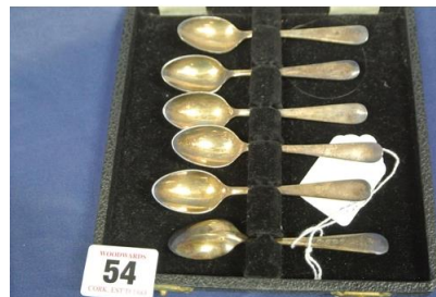
54. Set of 6 Sheffield silver rat-tail coffee spoons in presentation case W 60g