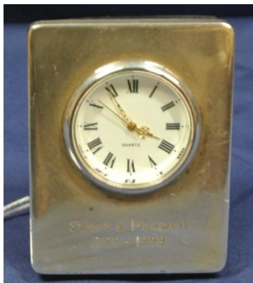
71. Small London silver framed bedside clock by Asprey & Garrard, inscribed 'Sweet & Maxwell, 1799-1999' H6.5cm W5cm Total W 63g