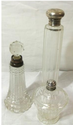
36. 3 perfume bottles, one with London silver top