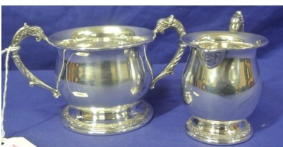
174. Irish silver cream jug and sugar bowl with shaped handles, Celtic design round bases, makers mark 'LG', having 'Sword of Light' commemorative hallmark for 1966. 327g