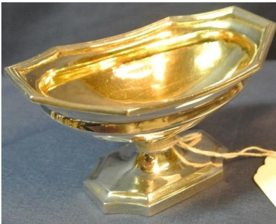
106. London Victorian silver and parcel gilt salt of oblong hexagonal form with reeded rim, on raised base, 1889