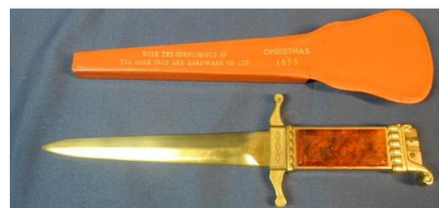
177. Brass & marble lighter in the shape of a dagger with scabbard, 'With the compliments of The Cork Iron and Hardware Co Ltd, Christmas 1955'