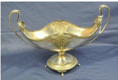
3. Oval silverplated vase with serpentine rims, scroll and foliate decoration, shaped handles, on 3 cast feet