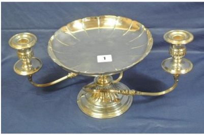
1. Silverplated centrepiece with central round scalloped dish, shaped candle sconces, on spreading round base