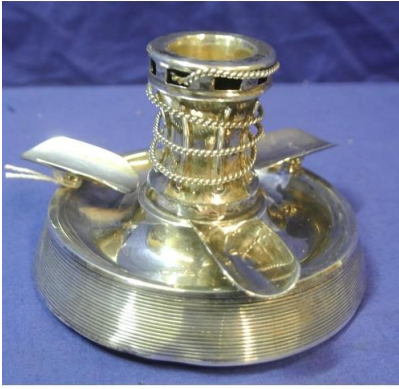
135. Chester silver candlestick ashtray with wire decoration, on reeded round tapering base 422g(filled) 12cm diam