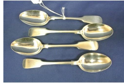
146. Set of 4 Sheffield silver dessert spoons with fiddle pattern handles, 1894,