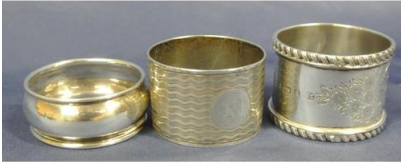
111. 3 English silver napkin rings, Birmingham, Chester and Sheffield, tot 67g