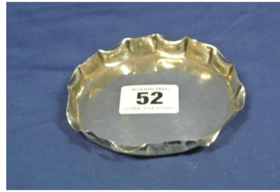
52. Birmingham silver small round card tray with scalloped rim D 9 x9cm W 27g