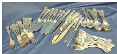
6. Lot of Newbridge silver plated Kings pattern cutlery