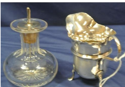
70. Small Birmingham silver cream jug with scroll handle and London silver topped glass oil dispenser bottle . 57g H 8cm